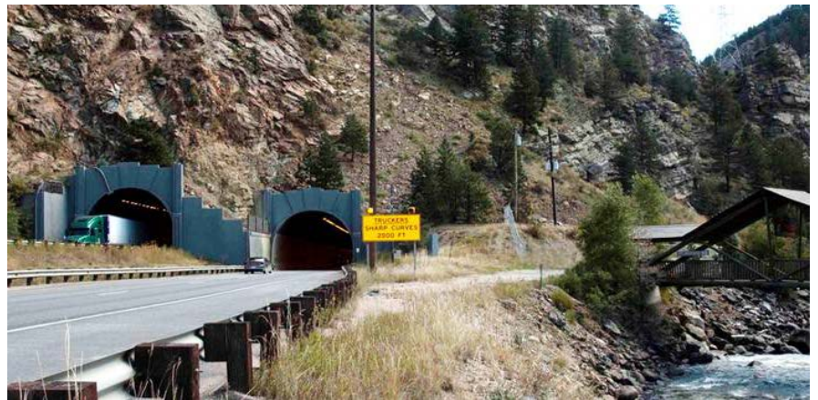
The Twin Tunnels are located in an environmentally sensitive area due to wildlife and a nearby stream.

The Colorado Department of Transportation (CDOT) applied the principles of EDC in developing the Environmental Assessment (EA) for its I-70 Twin Tunnels project to streamline development efforts, reduce duplication, and inform decisionmaking. The Twin Tunnels EA, which was completed in July 2012, is CDOT's first Tier 2 National Environmental Policy Act (NEPA) process that follows the interagency involvement commitments of the I-70 Mountain Corridor Programmatic EIS (PEIS). The I-70 Mountain Corridor PEIS serves as a guide for CDOT's collaborative efforts, as well as for data collection and analysis activities for all transportation improvements within the I-70