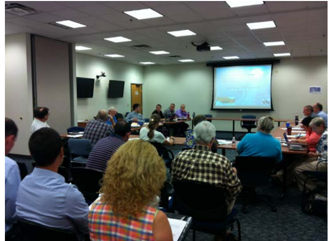
Public outreach was a critical component of CDOT's strategy.

CDOT's collaborative process to develop the EA for the Twin Tunnels project demonstrates how extensive stakeholder involvement can be used to streamline a project. A holistic visioning process, such as this one, ensures that all involved parties have their voices heard. The collaborative process also gave the various stakeholders ownership and kept them committed to the project by participating in frequent meetings throughout the year. This provided quick feedback and the necessary support to move the project forward. By having a process that included regular opportunities for stakeholder input on the project's goals, core values, criteria, and desired outcomes, CDOT was able to accelerate the project schedule and avoid backtracking, which is common in project development processes that do not use the principles of EDC. CDOT's collaborative approach demonstrates that building trust with stakeholders at all levels is an integral part of expedited project delivery. FHWA formally recognized CDOT's achievements with a 2013 Environmental Excellence Award for Environmental Streamlining.