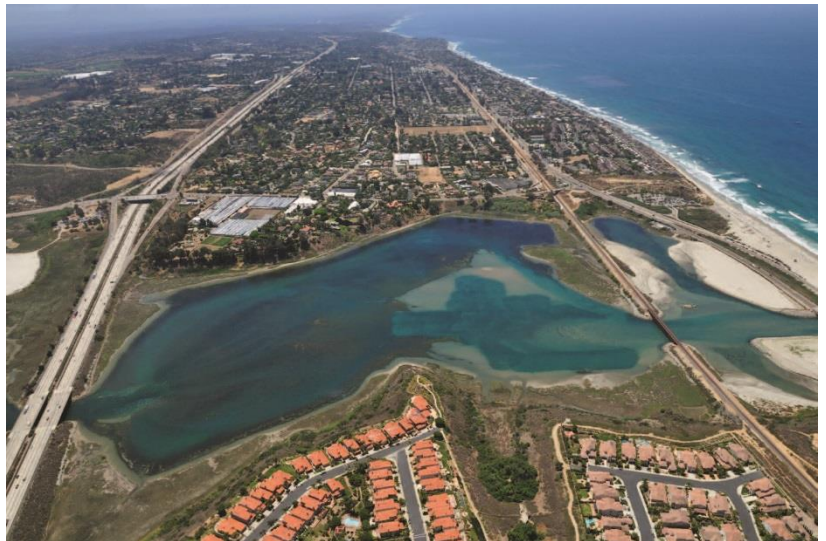
The Batiquitos Lagoon in Carlsbad, California, one of six lagoons in San Diego County. Efforts to improve the health of these lagoons include preserving existing ecosystems, restoring disturbed uplands, and mitigating the effects of stormwater runoff from nearby roads.

To improve the quality of life for residents, promote regional economic growth, and protect and enhance the coastal environment, the California Department of Transportation (Caltrans), the San Diego Association of Governments (SANDAG), and other regional stakeholders developed the NCC Program. This issue of Successes in Stewardship will introduce this 40-year, $6 billion program by highlighting the multimodal transportation improvements and environmental enhancements that address the needs of the NCC.