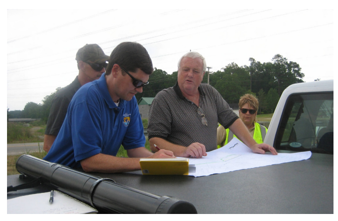
USFWS field inspections in South Carolina.

Meaningful and successful initial engagement will facilitate sustained involvement and commitment to subsequent steps of the process. The degree to which PMPs are useful later in the project development process frequently depends on the extent of consultation and the level of detail that is developed during the preliminary planning process. Having early and meaningful consultation with the resource agencies that have jurisdiction over a particular resource will help manage risk associated with mitigation and satisfy permit requirements as a result.