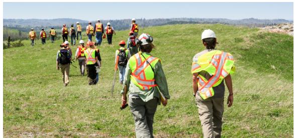
Site inspection.

the project(s) may occur well outside of the footprint of the project(s); and