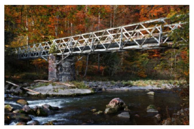
Historic\ bridge.\ (Photo:\ Ricardo\ Angel,\ Unsplash)

The questions on the following page can help to determine if programmatic mitigation is a good fit for a transportation agency. However, ongoing coordination and communication with resource and regulatory agency partners is critical to making this determination. These agency partners can help identify the potential impacts of programmed projects, identify existing conservation plans, and frame possible programmatic mitigation options.