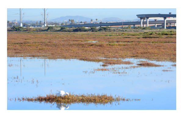
Sweetwater Marsh, CA.