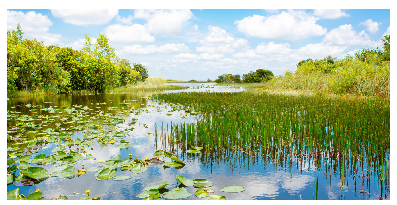
Florida wetlands.

Except for the statutes and regulations cited, the contents of this document do not have the force and effect of law and are not meant to bind the public in any way. This document is intended only to provide information regarding existing requirements under the law, agency policies, and Administration priorities.