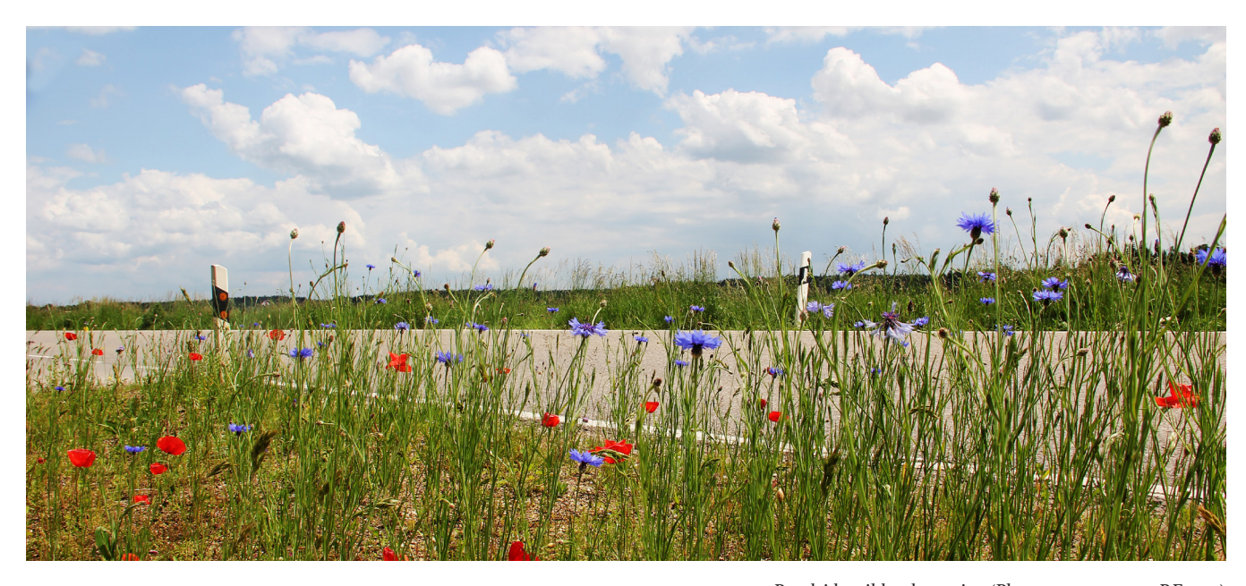
Roadside wild red poppies.