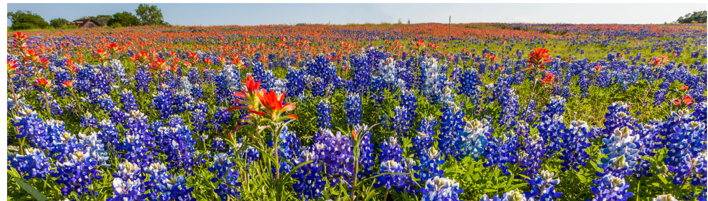
29 PEL is authorized by 23 U.S.C. §§ 168 and 139(f). See also 23 CFR 450.212, 23 CFR 450.318, and Appendix A of 23 CFR Part 450.

Additional information on these initiatives and other resources related to programmatic mitigation planning can be found at <u>FHWA's Environmental Review Toolkit</u>.