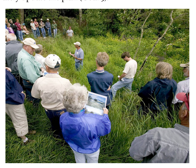
Stakeholder tour of Blackfoot Valley, MT.

After receiving ample feedback from key stake-holders and the public, the State DOT compiled and reviewed comments. The State DOT carefully considered each comment, and documented how each comment was responded to or addressed in the plan (Goal 2). After all the comments were considered, the State DOT was able to appropriately update the plan (Goal 3).