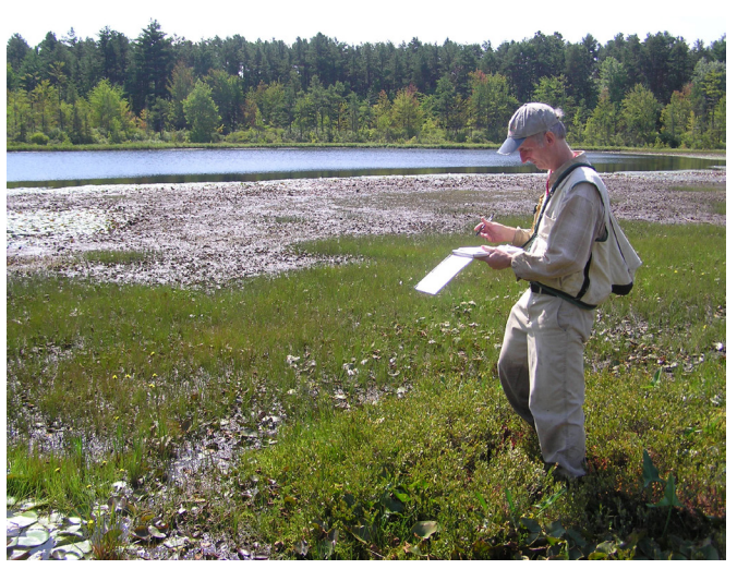
Testing water quality.

Areas with few major transportation projects can still take advantage of programmatic mitigation. If one agency's programmed projects alone do not warrant a programmatic approach, agencies can consider forming partnerships and broadening the scope of the PMP to include other agencies' projects. PMPs can provide greater economic and ecological benefits to agencies simply by grouping projects together. Mitigation can help standardize costs, so combining needs from multiple projects to conduct mitigation can generate more predictable timelines and cost savings. Further holistic mitigation strategies that consider impacts at multiple stages or from multiple projects can create more impactful ecological improvements than project-by-project mitigation.