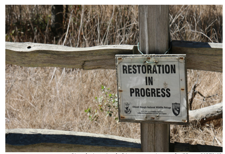
Sign designating habitat restoration work.