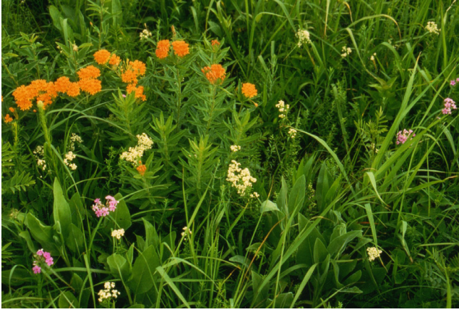
The ecoregional approach seeks to reintroduce native plants to roadsides for economic and environmental benefits.

methods for a number of reasons. The ecoregional approach seeks to reintroduce native plants to roadsides for environmental, economic, and even cultural benefits. For instance, the solution restores the country's roadsides to reflect the natural biodiversity of each region. Other benefits include greater ecological diversity, more suitable habitat for wildlife, improved natural aesthetics, better erosion control, and a reduction in mowing and in water and fertilizer use, which can significantly reduce fuel and other maintenance costs. Less fuel also means less greenhouse gas emissions.