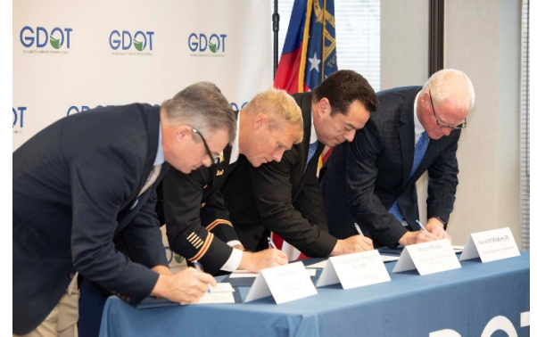
Figure 3. Signatories from FHWA, GDOT, USACE Savannah District and GA DNR prepare to sign the Section 106 PA in Atlanta, GA.

Wisconsin's Section 106 program. Interviews were conducted with the FHWA Division Office, Wisconsin DOT, the SHPO, and tribal historic preservation specialists. FHWA is currently compiling a report and presentation with findings from the program assessment and will hold a two-day virtual workshop in November 2020 with State and