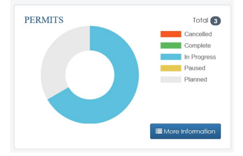
Figure 5. Screenshot of INPCT's permit tracking feature.

share data with FHWA's Project and Program Action Information System (PAPAI), manage document version control, and improve the graphical user interface to make the tool easier to navigate.