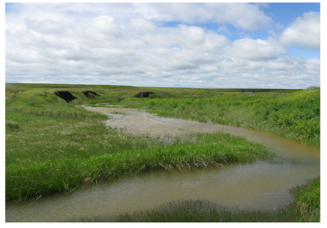
Figure 2. Potential mitigation opportunity in Idaho.

\label{eq:result} \begin{array}{l} \text{Avoid} \rightarrow \text{Minimize} \rightarrow \text{Repair or Restore} \rightarrow \text{Reduce over time} \\ \rightarrow \text{Compensate.} \end{array}