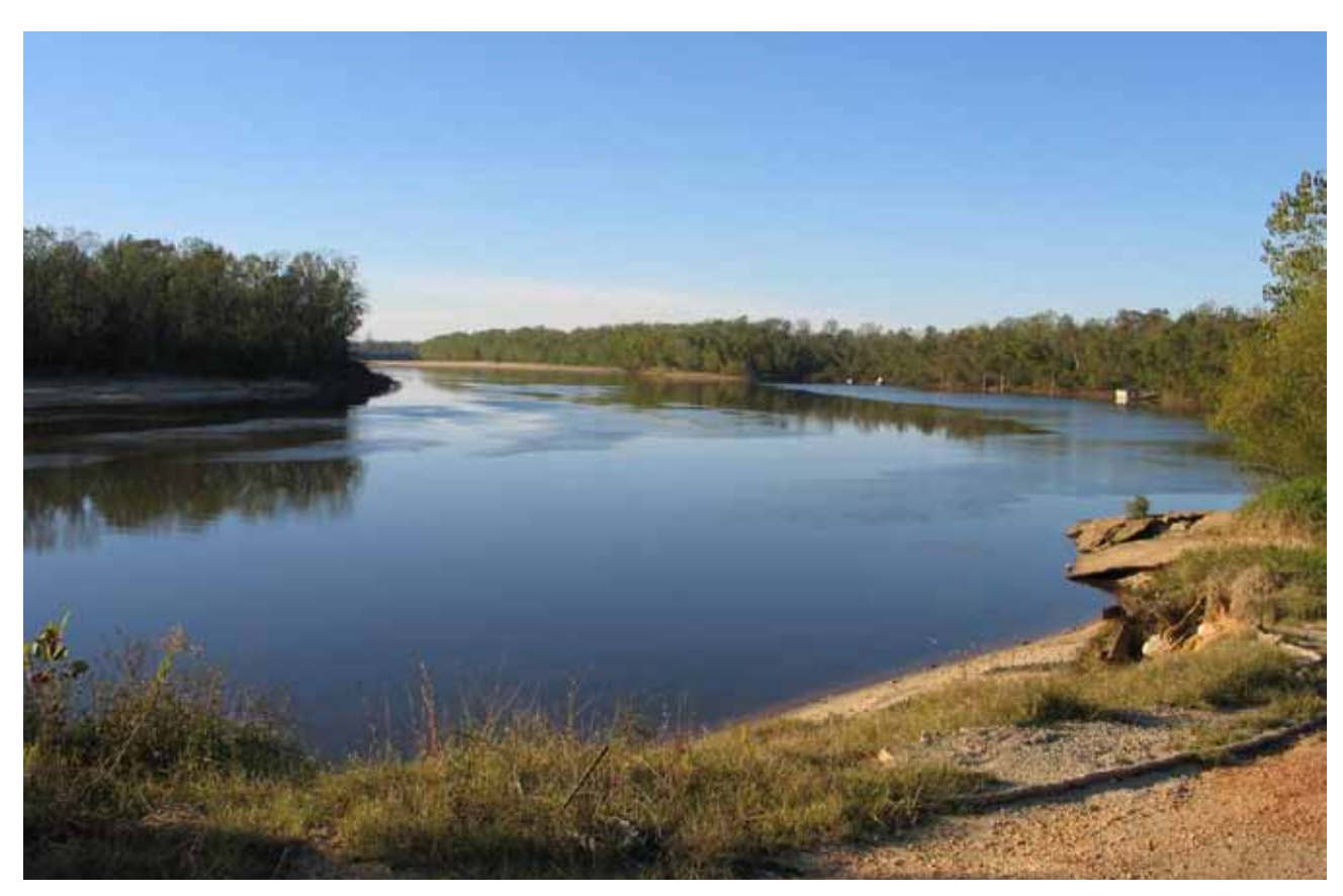
Alabama River at Dixie Crossing.

BLM's Landscape Approach and FWS's Strategic Habitat Conservation Framework are complementary efforts that will become more fully integrated through the LCCs. The LCCs will facilitate partnerships among the public and private agencies and organizations in an area, through which conservation and natural resource management can be coordinated.