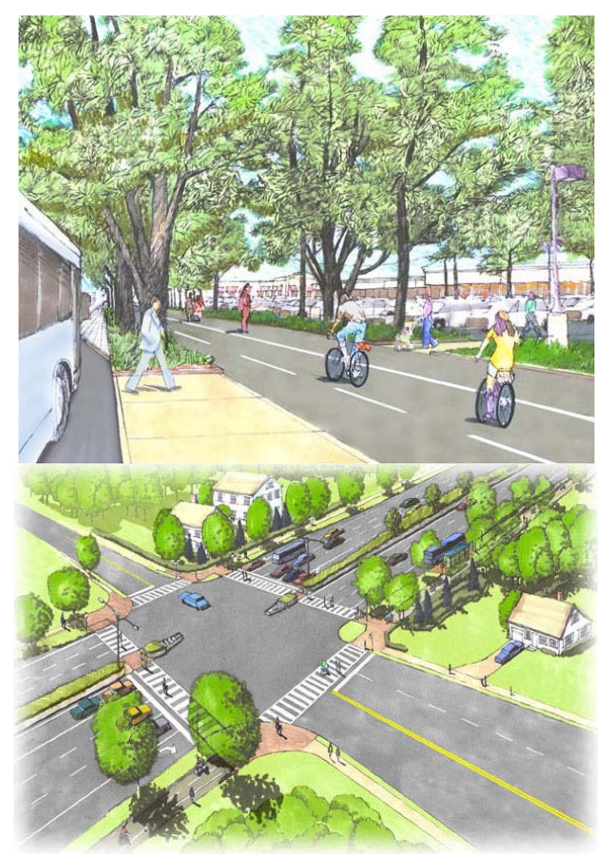
Ground-level and aerial schematics depict planned bicycle and pedestrian paths, green medians, and visible crosswalks along a 15-mile stretch of New York Route 347.