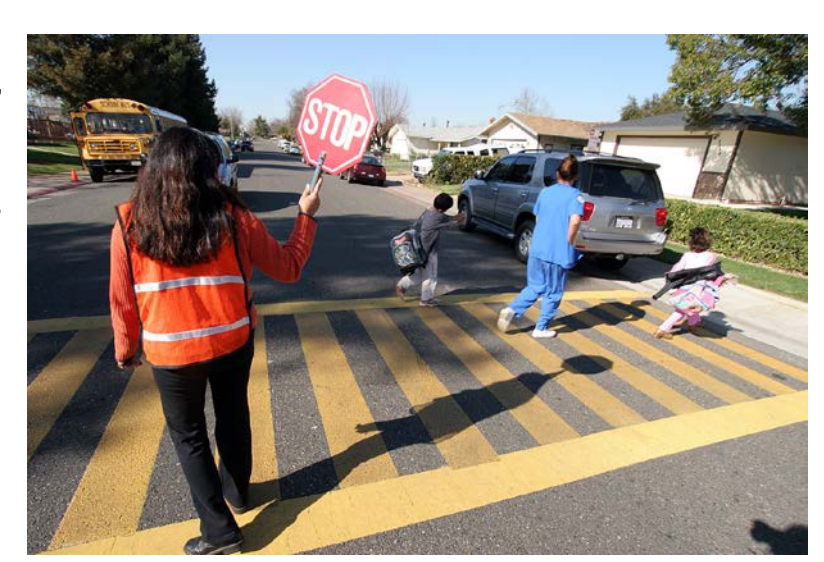
FHWA works to make roads safer for all users, including pedestrians.

The primer provides important background information, including an overview of Transportation Safety Planning initiatives such as State Strategic Highway Safety Plans (SHSP) and the integration of SHSP priorities into other plans and programs. It also outlines and describes the basics of the NEPA process, covering Categorical Exclusions (CE), Environmental Assessments (EA), and the steps of Environmental Impact Statements (EIS). It then describes the benefits of linking Transportation Safety Planning and NEPA processes. For instance, the NEPA process can provide an opportunity to promote conversation with the general public and key safety stakeholders, such as engineers and local law enforcement officials, regarding the safety aspects of a project. Additionally, connecting Transportation Safety Planning to project development processes helps to make individual projects consistent with regional- or State-level safety goals and plans. The primer discusses both specific