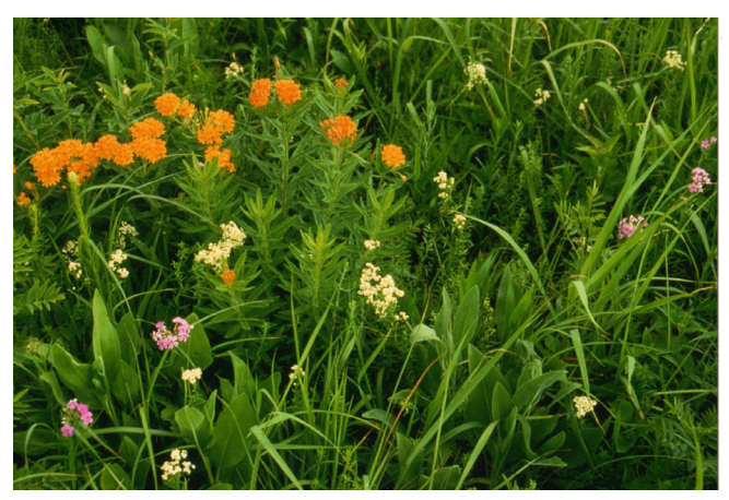
The ecoregional approach seeks to reintroduce native plants to roadsides for economic and environmental benefits.

methods for a number of reasons. The ecoregional approach seeks to reintroduce native plants to roadsides for environmental, economic, and even cultural benefits. For instance, the solution restores the country's roadsides to reflect the natural biodiversity of each region. Other benefits include greater ecological diversity, more suitable habitat for wildlife, improved natural aesthetics, better erosion control, and a reduction in mowing and in water and fertilizer use, which can significantly reduce fuel and other maintenance costs. Less fuel also means less greenhouse gas emissions.