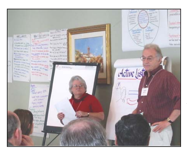
Table 4. Feedback on the Quality of Workshop Facilitation

"The facilitators were excellent at remaining (or appearing to remain) totally unbiased."